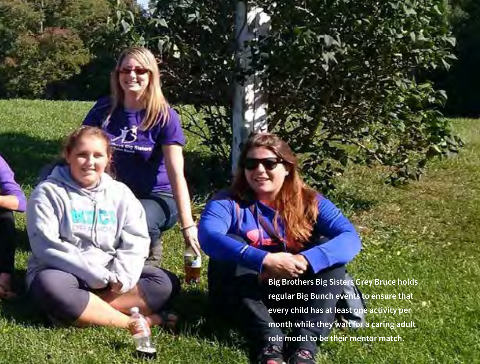
Big Brothers Big Sisters Grey Bruce holds regular Big Bunch events to ensure that every child has at least one activity per month while they wait for a caring adult role model to be their mentor match.